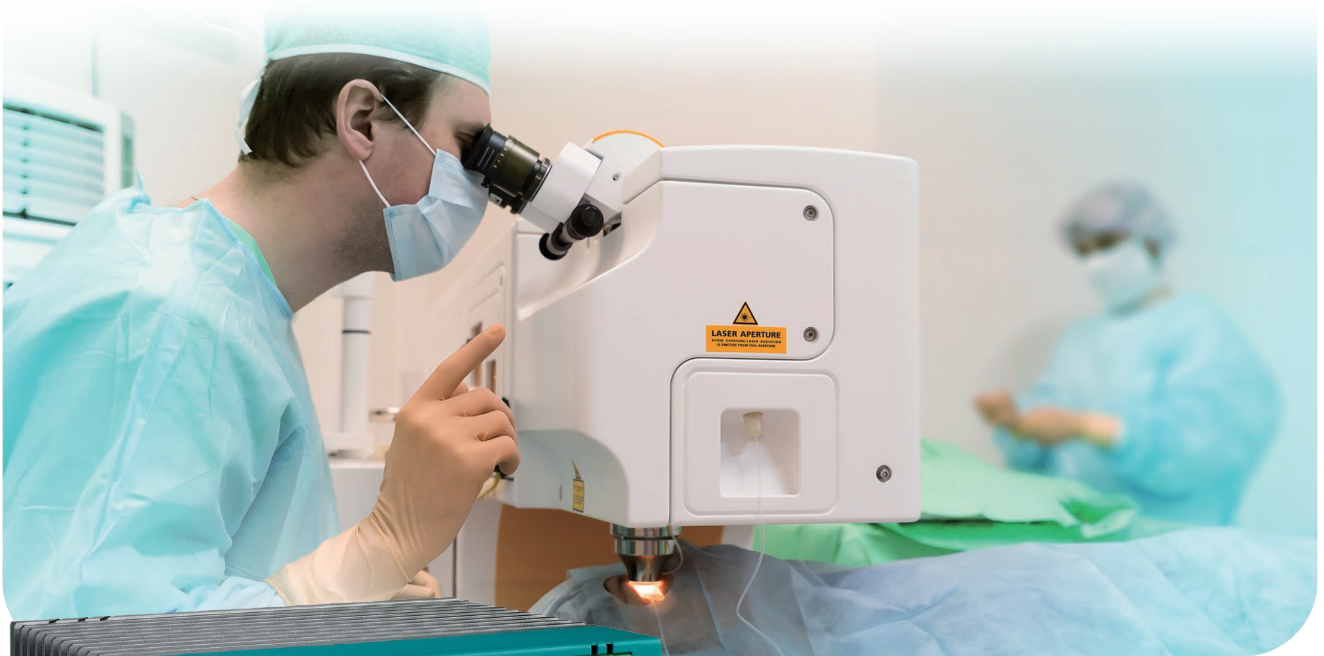
^ Medical Imaging

NVIDIA® Jetson Orin™ NX Embedded AI Computing System