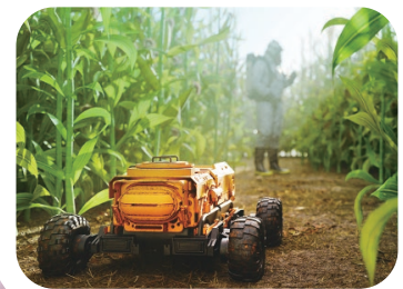
^ Mobile Robots