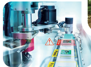
v High-speed AOI